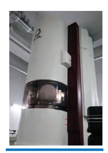
Transmission Electron Microscope