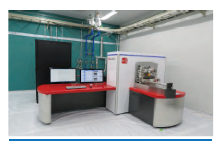
3D Atom Probe Microscope