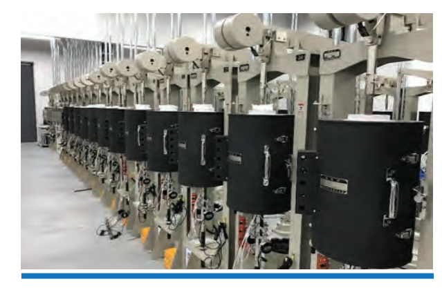
Creep testing machine