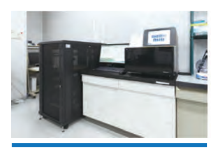
Radiation-induced-mutation analysis facility