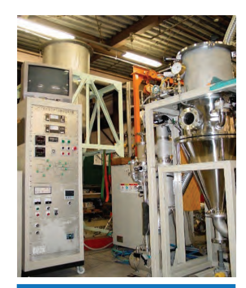
Molten metal droplet test facility "CANOPUS"