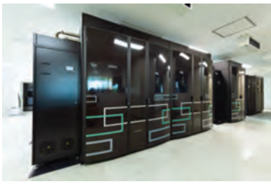
Supercomputer (HPE SGI8600) <Specification> 660 CPU nodes, 26,400 CPU cores, processing speed: 2.02 PFLOPS