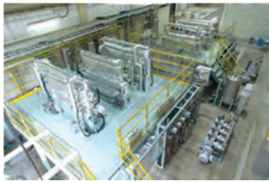
Thermal power water supply treatment tester