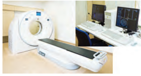
Helical X-ray CT scanner