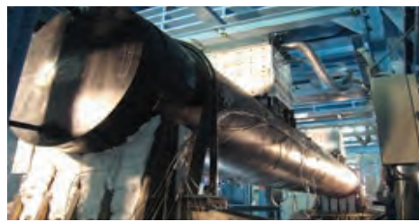
Bending & Internal Pressure on real structural samples (BIPress)