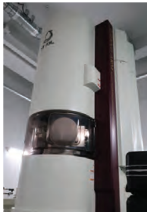
Transmission Electron Microscope