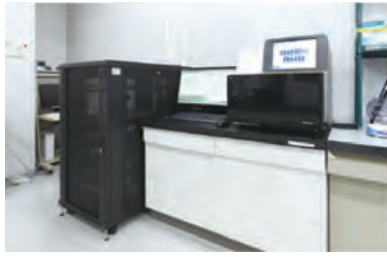
Radiation-induced-mutation analysis facility