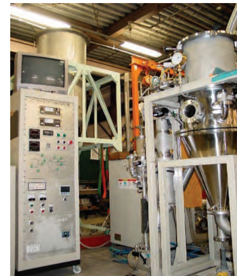
Molten metal droplet test facility "CANOPUS"