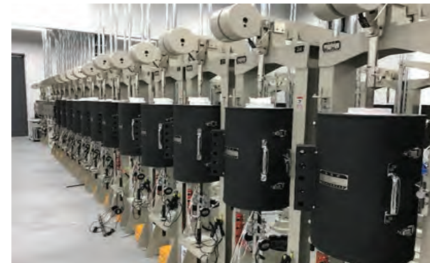
Creep testing machine