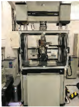
Fatigue testing machine