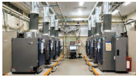
High Reliability Test Facility for Lithium Ion Batteries (Charge/Discharge Testing Facility)