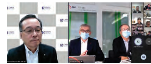
Annual meeting with EDF

CEA (France), EDF (France), EPRI (United States), KEPCO RI (Korea), KERI (Korea), KHNP CRI (Korea), OECD/NEA (International Organization), SCK-CEN (Belgium), SwRI (United States), TPC, TPRI (Taiwan)